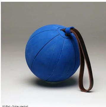
WfBall - Schleuderball