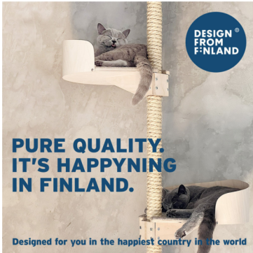
Design from Finland