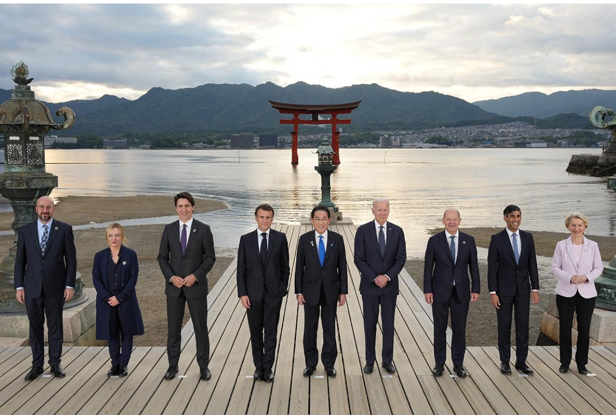
G7 Hiroshima Summit 2023