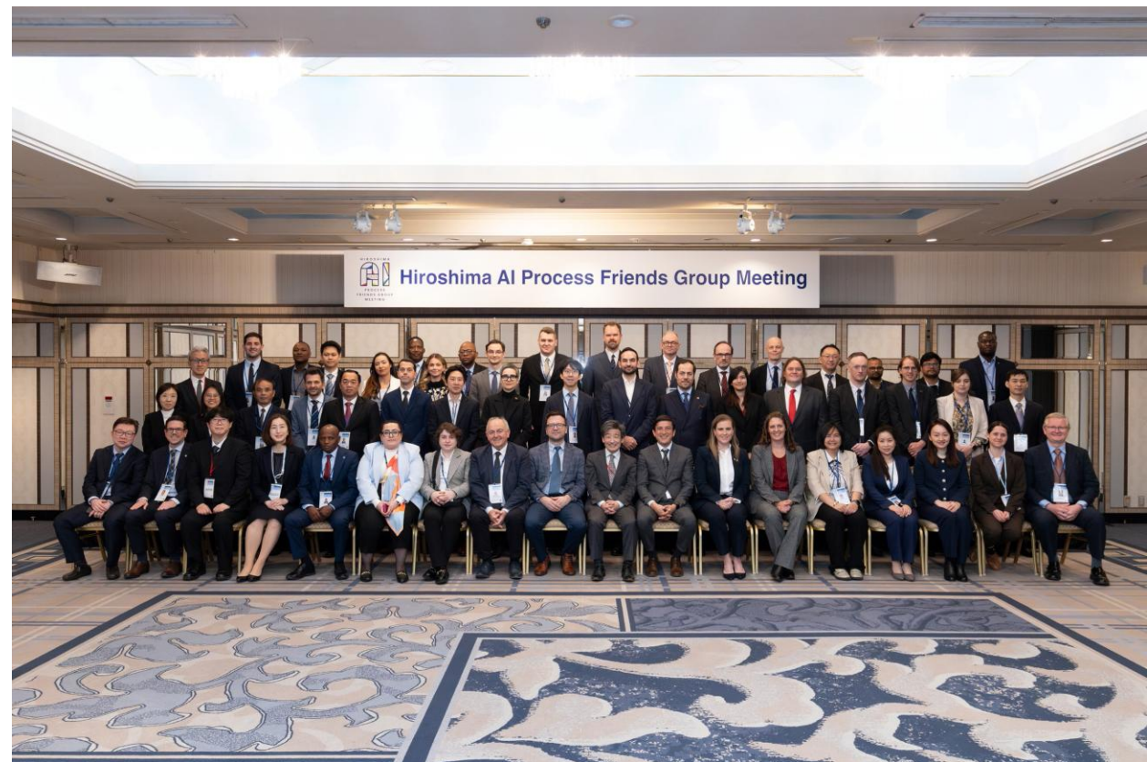
Friends Group 1st in-person Meeting (2025.2.27-28)