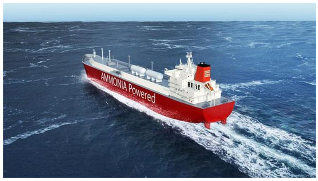
Image of the vessel's operation from Mitsui O.S.K. Lines (MOL) website

Mitsui O.S.K. Lines (MOL) website: https://www.mol.co.jp/en/pr/2021/21098.html