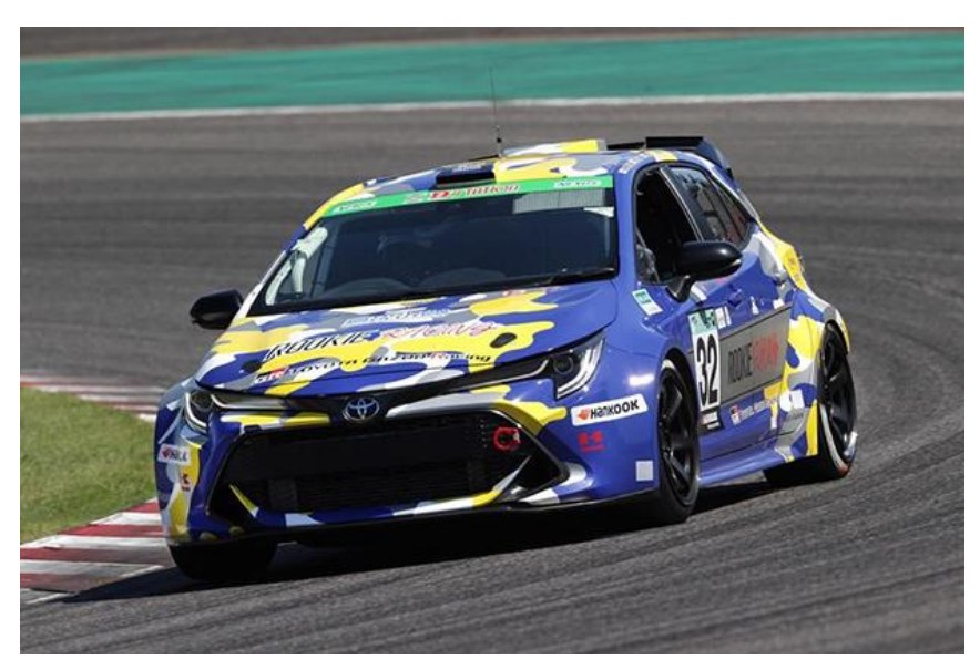
Hydrogen-engine vehicle during the SUZUKA S-TAI

EU-Japan Centre for Industrial Cooperation 日欧産業協力センター