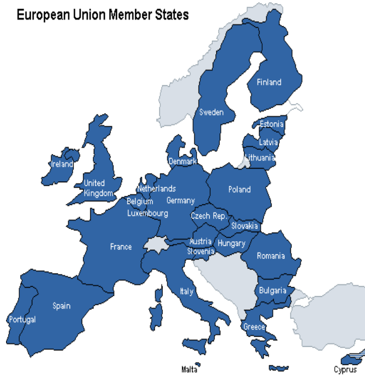
European Union Member States