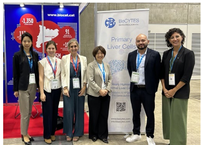
Biocat booth at BioJapan 2023