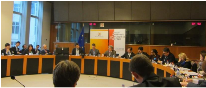
EU Japan EPA Event in the European Parliament