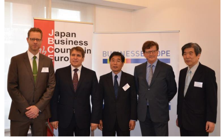
Breakfast meeting with Chief negotiators (Co-host with BusinessEurope)