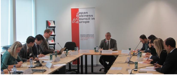
Roundtable with European Parliament rapporteur