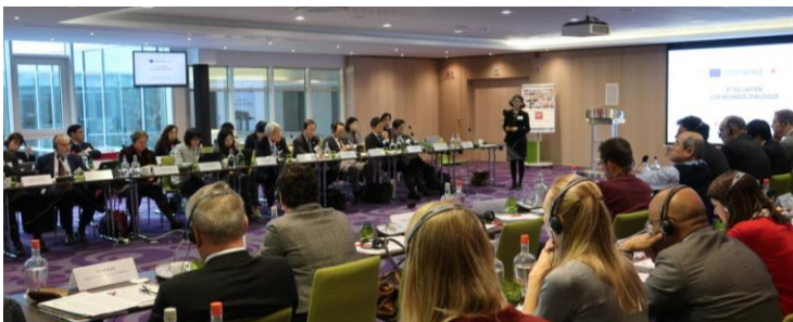
EU Japan CSR Business Dialogue